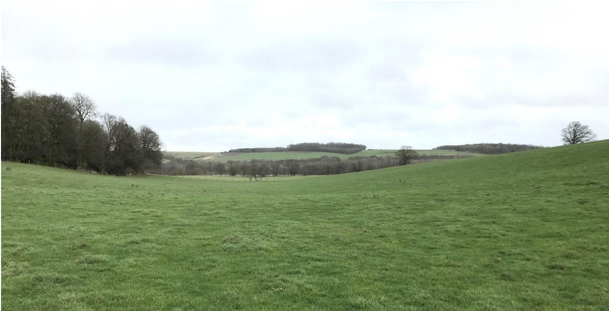
Fig.2. View northeast to application site from within, and at the foot of, Hog Trough valley within the parkland of Luton Hoo (approximately corresponding to N2 in Fig.3 below).