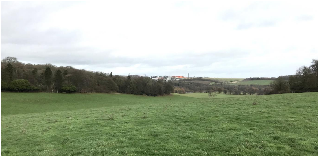
Fig.1. View northeast to application site from land to the side of, and above, Hog Trough valley within the parkland of Luton Hoo (approximately corresponding to N1 in Fig.3 below).

Two further AVR viewpoints are put forward (referenced as N1 and N2 on Fig. 3 below), and it is requested that Assessment Viewpoint Location No.44 (Stockings Wood), as shown on Fig.14.8 in ES Statement Chapter 14 - document TR020001-001084-5.03 (Revision 01), but mislabelled as 'Stopsley Wood', is included as an AVR photo montage, for complete clarity.